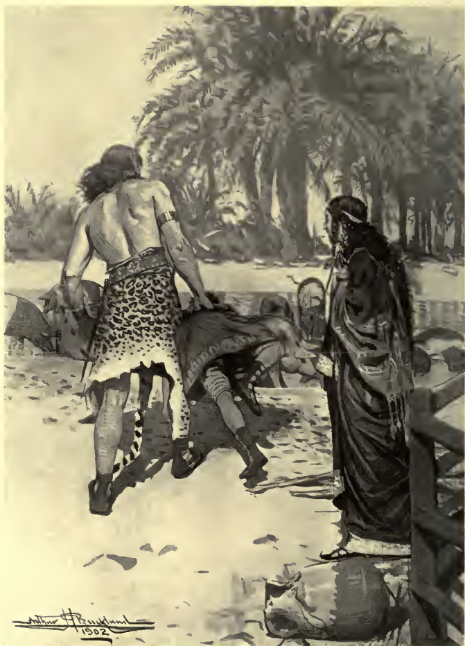
SO SAMSON CARRIED HIM TO A SPOT WHERE A HERD OF SWINE WERE